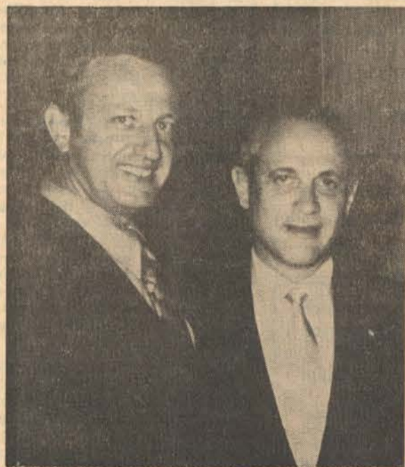
State Senator Royal Hart with Governor Marvin Mandel.