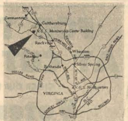
The National Geographic Society Membership Center Building is located on Route 28, 6 miles west of Rockville. Personnel office in the building.