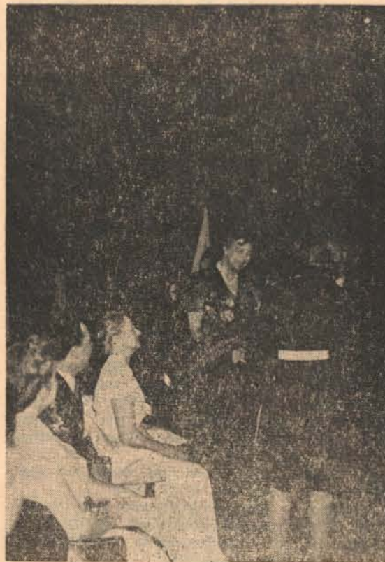
Mrs. Roosevelt as she appeared at a Defense Rally at the Center School in February, 1942, receiving a bouquet of flowers. Her presence drew a capacity crowd and raised over $1,000.

The "Roosevelt tree," an oak on Crescent Rd. near the Baptist Church property which served as a vantage point for Mrs. Eleanor Roosevelt to survey the construction of some of the first buildings in Greenbelt, will be marked off soon as a permanent memorial. A project of the Greenbelt Woman's Club, the tree will be enclosed by a wrought iron fence. As the city's contribution toward this project, the Public Works Dept. last week delivered the fencing to the site and will soon install it.