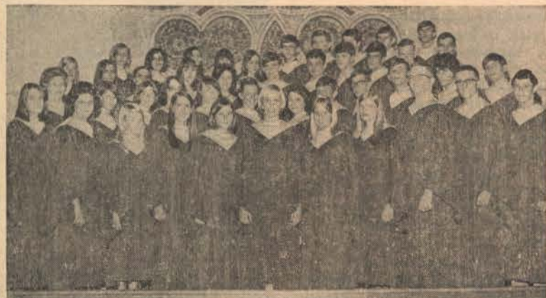
Special Guests — Chapel Choir of Emmanuel Baptist Church, Alexandria, Louisiana

GREENBELT BAPTIST CHURCH Crescent and Greenhill Roads