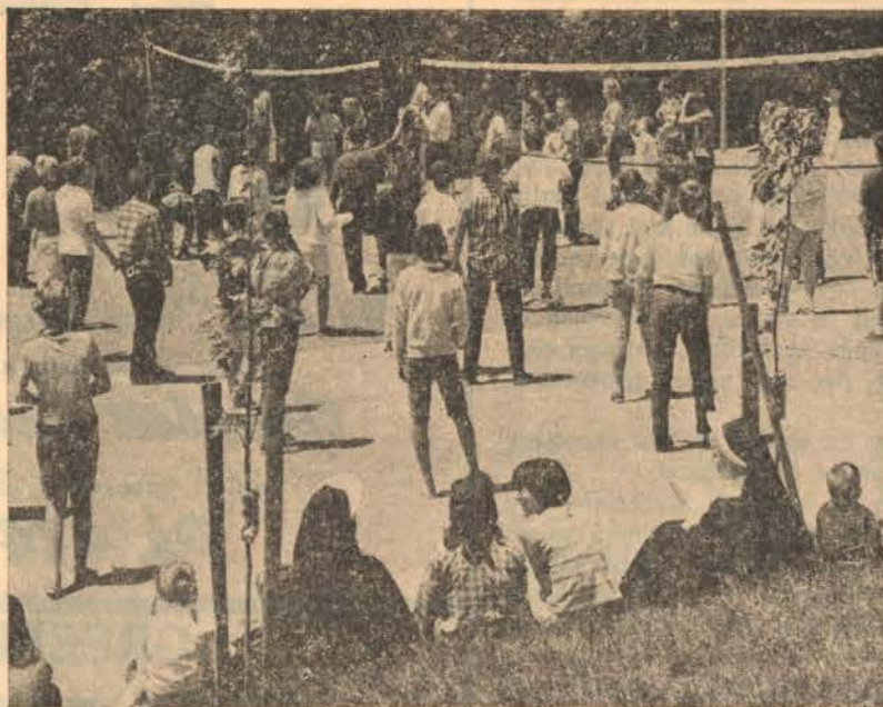
ST. HUGH'S ANNUAL FIELD DAY. Faculty and students at the St. Hugh's school enjoy an animated game of volley ball on the school athletic grounds on May 26. Students and their families enjoyed a luncheon at the school after the game.

TIME IS RUNNING OUT. Write to Box 2, Greenbelt, if you intend to participate in the Greenbelt Labor Day Festival Deadline, June 30.