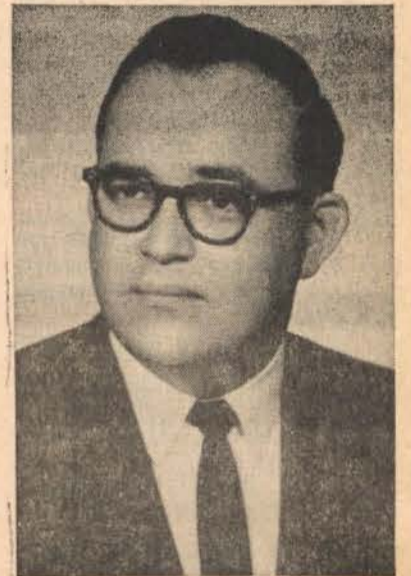
"THIS TIME — SEND A STATESMAN"