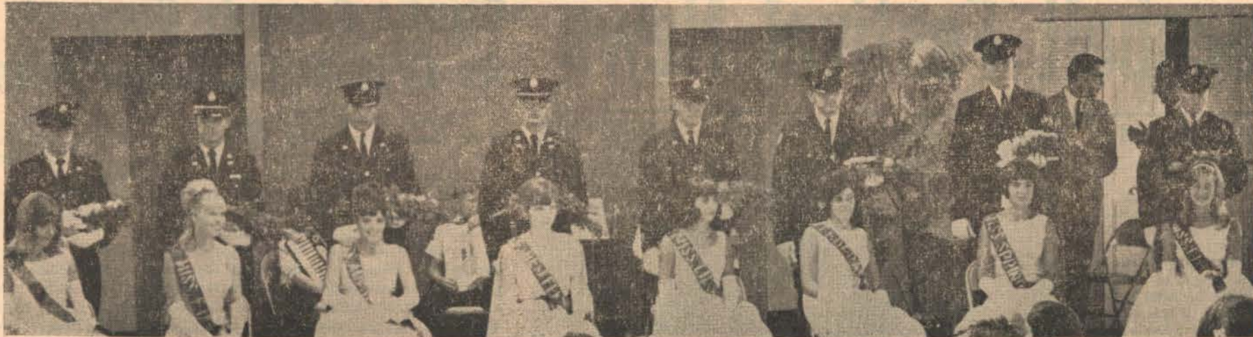
Greenbelt's first junior Miss Pageant was held at the Springhill Lake Community House, Sunday, Sept. 4 after being rained out Saturday night at the Center. The pageant was organized by the Toastmasters and Jaycees.