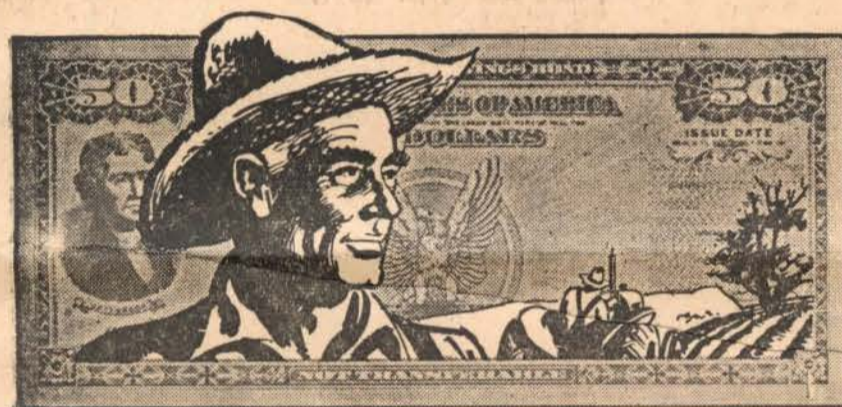
Money to insure that our productive power will thrive. . . .