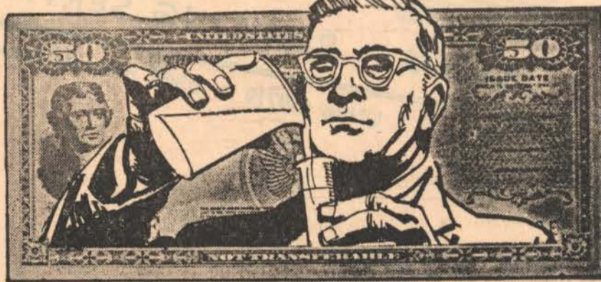
Money to let our scientists continue their search for answers. . . .