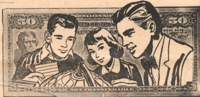
Money to help our children learn how to make peace lasting.

Yes, peace costs money. Money for research and schools and military preparedness. Money saved by you to keep our economy strong