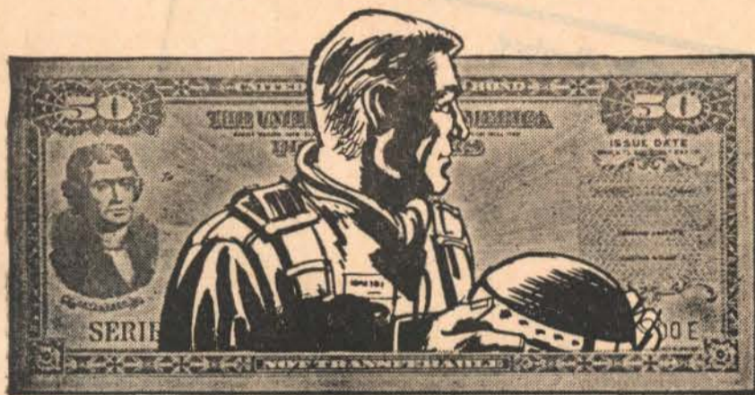
It takes money to keep our jet pilots patrolling the skies. . . .