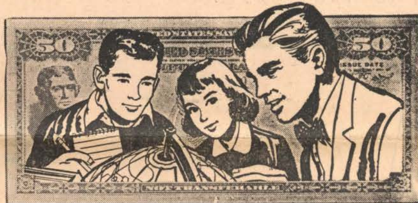
Money to help our children learn how to make peace lasting.

Yes, peace costs money. Money for research and schools and military preparedness. Money saved by you to keep our economy strong