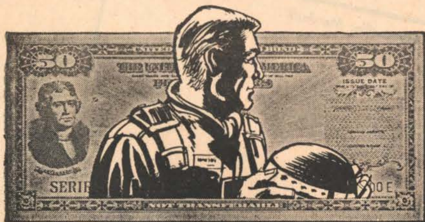
It takes money to keep our jet pilots patrolling the skies. . . .