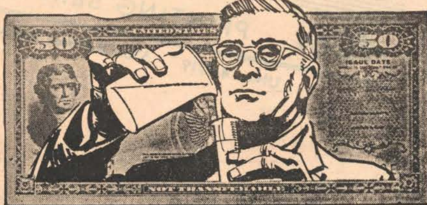
Money to let our scientists continue their search for answers. . . .