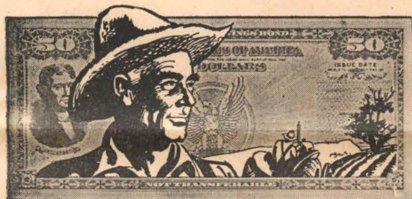
Money to insure that our productive power will thrive. . . .