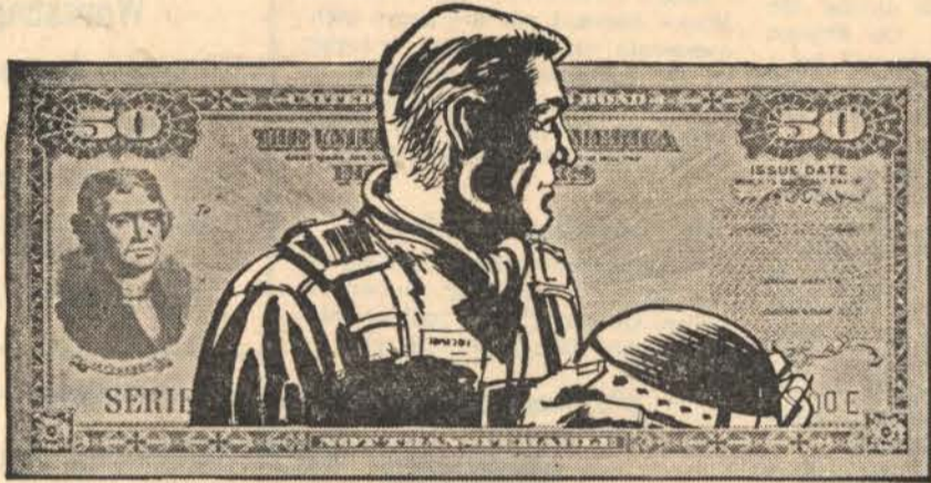
It takes money to keep our jet pilots patrolling the skies. . . .