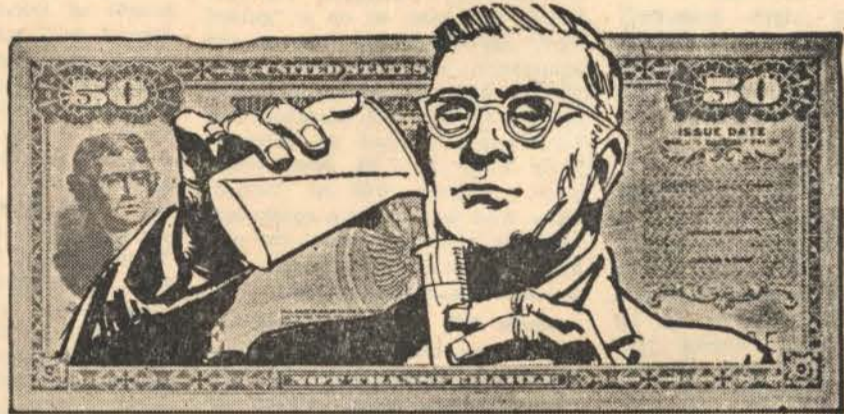
Money to let our scientists continue their search for answers. . . .