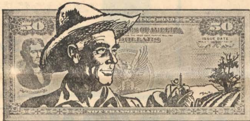
Money to insure that our productive power will thrive. . . .