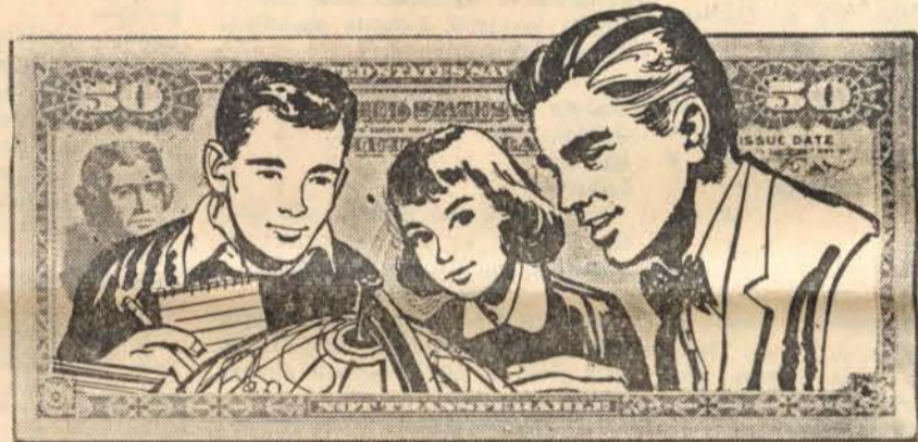
Money to help our children learn how to make peace lasting.

Yes, peace costs money. Money for research and schools and military preparedness. Money saved by you to keep our economy strong