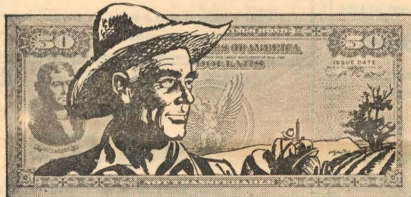
Money to insure that our productive power will thrive. . . .