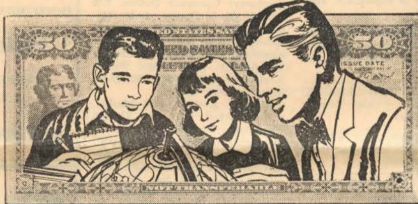
Money to help our children learn how to make peace lasting.

Yes, peace costs money. Money for research and schools and military preparedness. Money saved by you to keep our economy strong