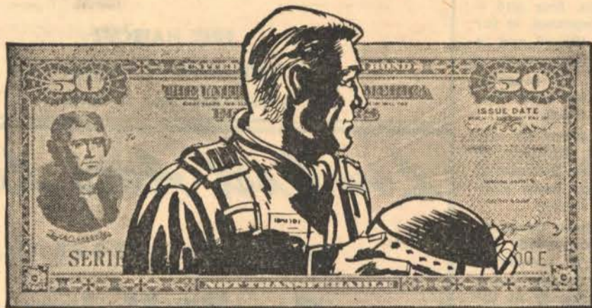
It takes money to keep our jet pilots patrolling the skies. . . .