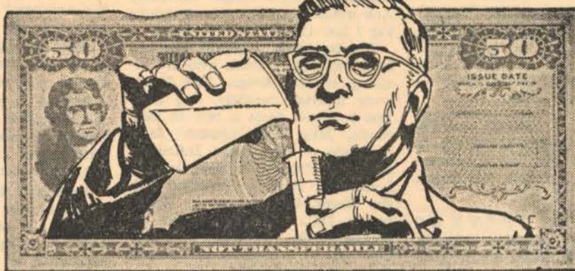
Money to let our scientists continue their search for answers. . . .