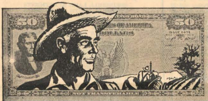
Money to insure that our productive power will thrive. . . .