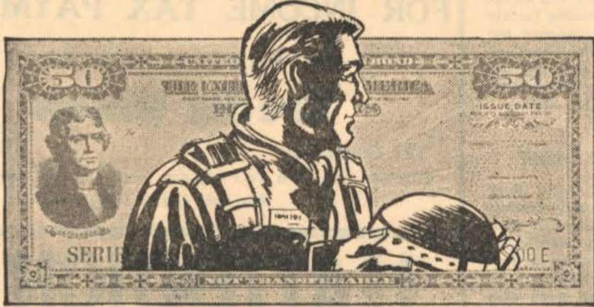
It takes money to keep our jet pilots patrolling the skies. . . .