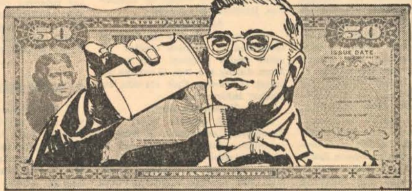
Money to let our scientists continue their search for answers. . . .