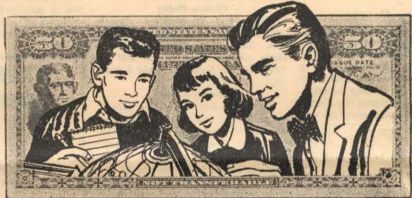
Money to help our children learn how to make peace lasting.

Yes, peace costs money. Money for research and schools and military preparedness. Money saved by you to keep our economy strong You and your family can be the strongest force of all for peace. Every Savings Bond you buy helps America keep peace in this troubled world. Think it over. Are you buying as many as you might ?