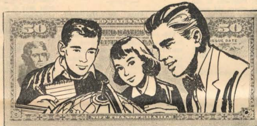
Money to help our children learn how to make peace lasting.

Yes, peace costs money. Money for research and schools and military preparedness. Money saved by you to keep our economy strong