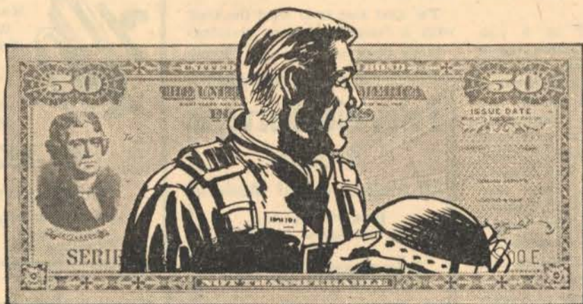
It takes money to keep our jet pilots patrolling the skies. . . .