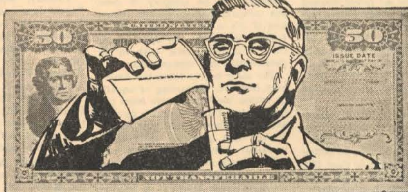
Money to let our scientists continue their search for answers. . . .