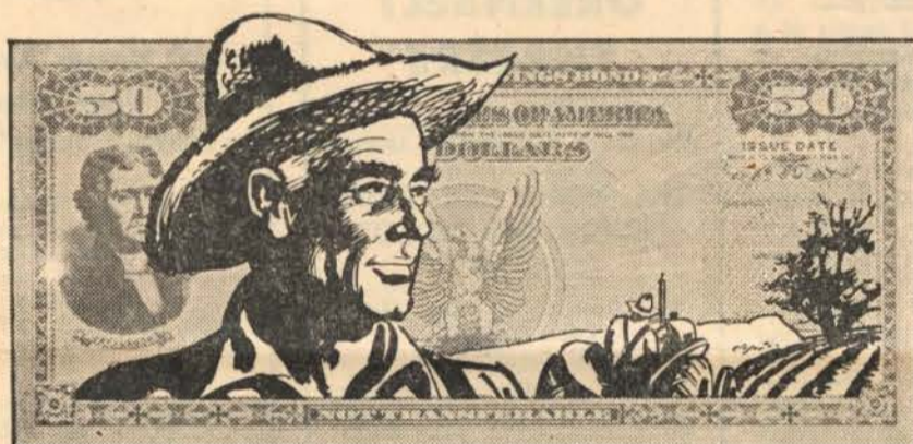
Money to insure that our productive power will thrive. . . .