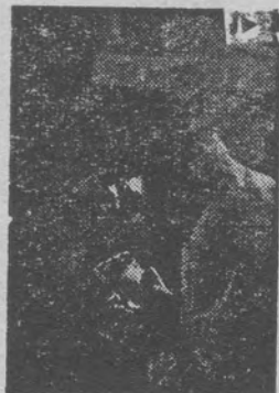
U.S. Savings Bonds are theft-proof! Fire-proof and loss-proof, too. Since 1941 the Treasury Department has replaced almost 1½ million Bonds at no cost to the owners.