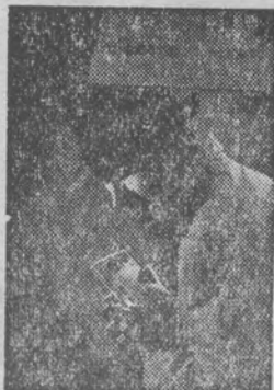
U.S. Savings Bonds are theft-proof! Fire-proof and loss-proof, too. Since 1941 the Treasury Department has replaced almost 1½ million Bonds at no cost to the owners.