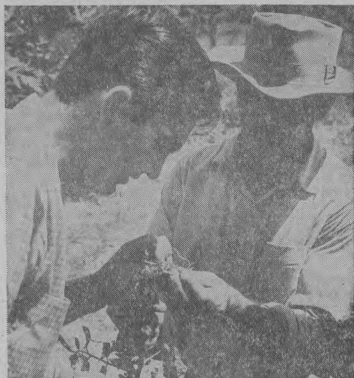
PEACE CORPS VOLUNTEER ADVISES A FARMER

The Peace Corps is officially two years old this week, and the amazing response of Americans — from all walks of life, from all sections of the nation—to this call to service is larger than ever.