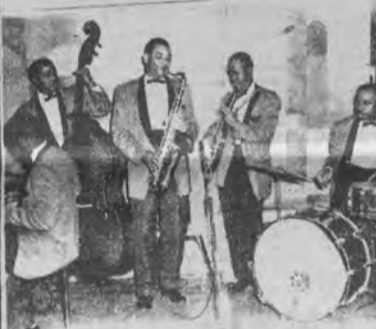
The music of the Altones will be featured at the St. Hugh's Fall Dance this Friday, October 20, from 9 p.m. to 1 a.m.