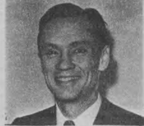
BILL PHILLIPS Complete Insurance Coverage

FRIENDLY Driver Training School Free Pick-Up Service WA. 7-8885