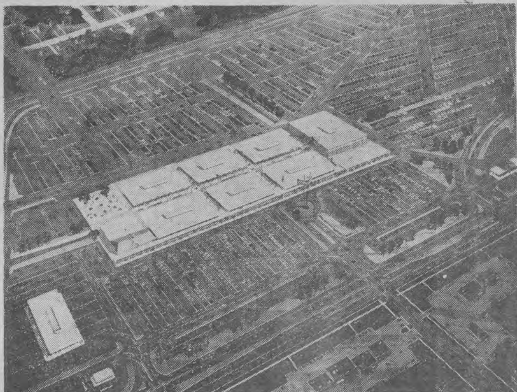
Architect's drawing of vast shopping center complex to be built in Greenbelt.