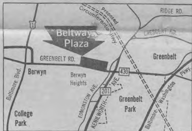
Map pinpoints location of new shopping center.

City Manager Charles McDonald, commenting upon the new proposal, pointed out that it would result, within the next two years, in a 50% increase in the present base, or an increase of $4 1/2