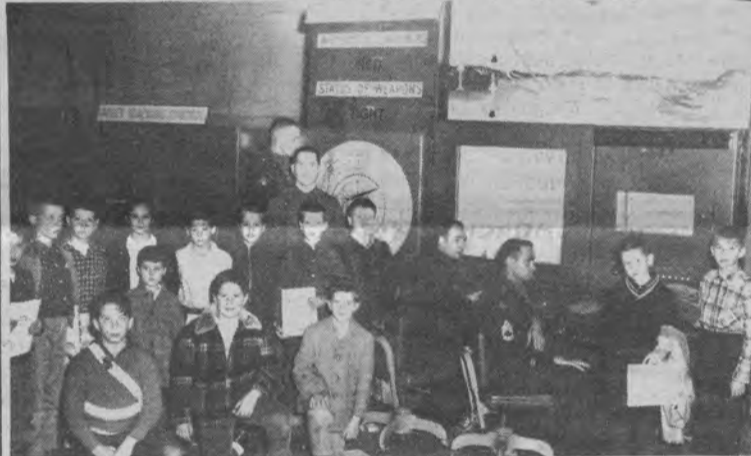
A group of fifth graders from Center School pose for their picture while visiting Civil Defense Headquarters at the Greenbelt National Guard Armory on Civil Defense Day.