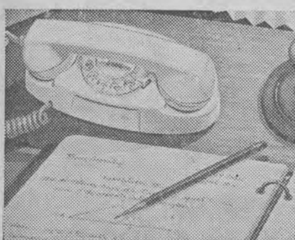
In a teen-ager's room