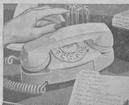
In the kitchen