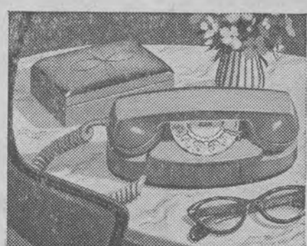
In the living room

Anywhere in your home that you want the convenience of an extension, you can now have a beautiful decorator piece at the same time.