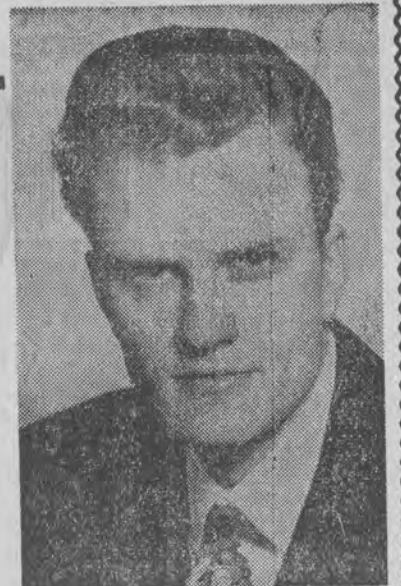
Dr. Billy Graham

In next week's News Review full particulars will be given as to how you may secure a reserved seat and be provided with bus transportation to Griffith Stadium.