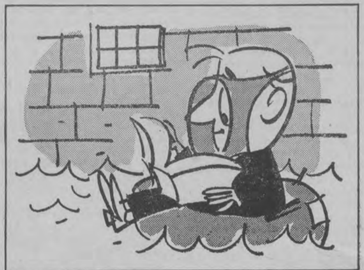
Need a boat dealer? waterproofing? swimming pool?