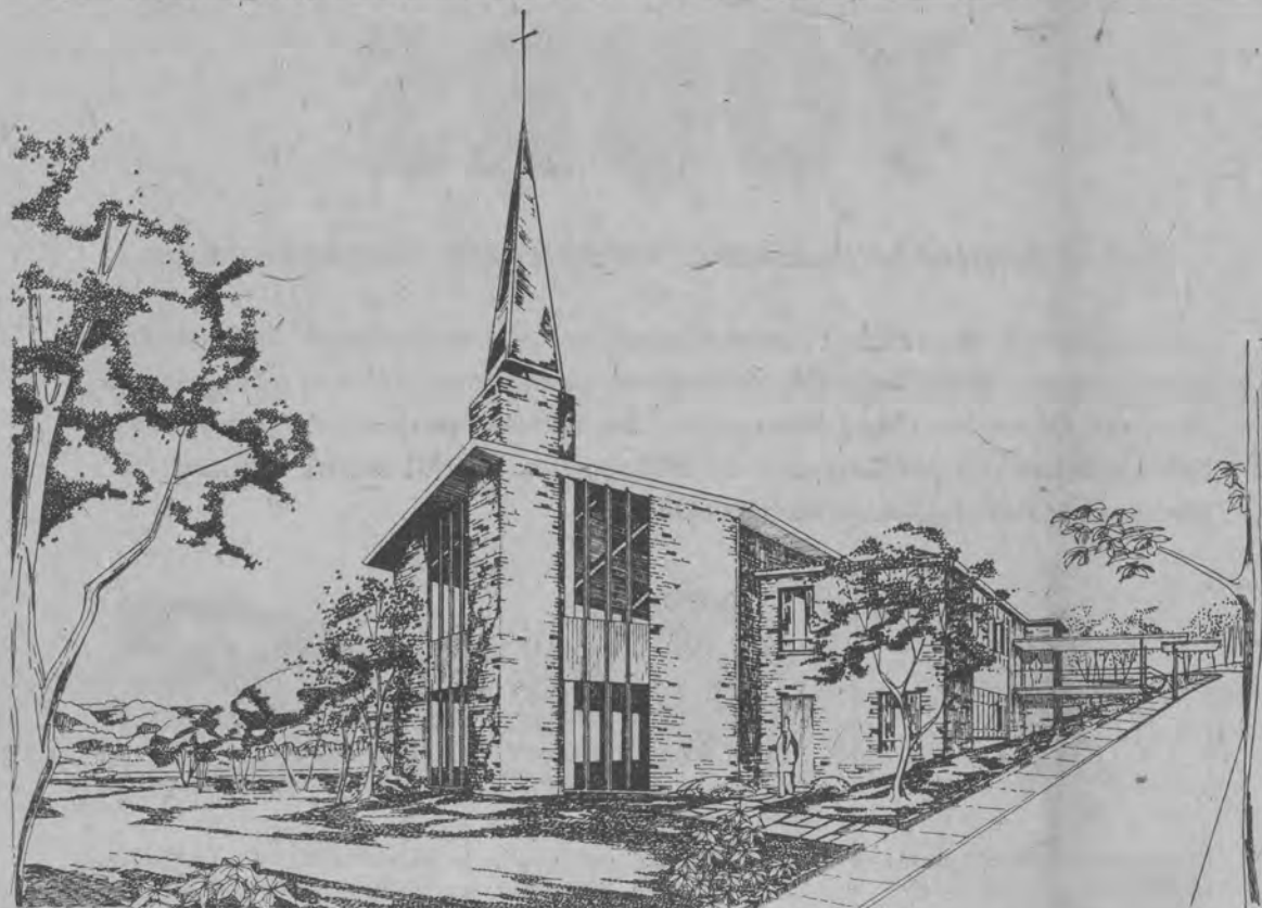
Proposed Greenbelt Baptist Chapel — First Unit

Published Every Thursday By The Greenbelt Cooperative Publishing Association, Inc. Vol. 21, No. 11 Greenbelt, Maryland, Thursday, October 18, 1956 Five Cents