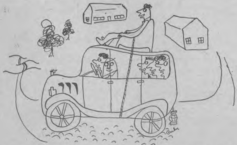
"What did he expect? Imagine takin Al Long's advice about conserving water by giving up baths..."

vacancies, which are now available on a first come-first served basis. Madden also revealed that a 12-name waiting list will be kept if more than five apply for future contingencies.