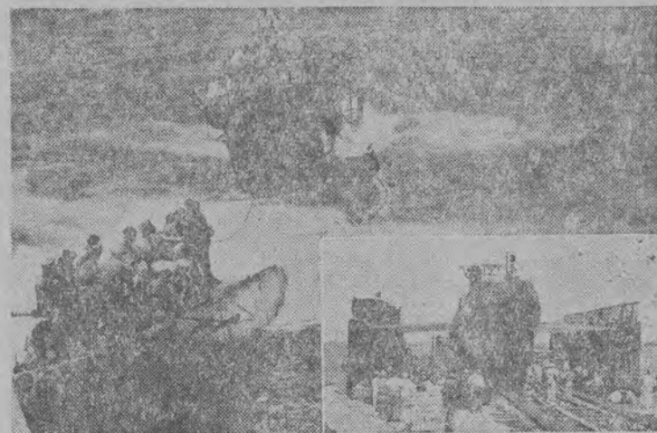
In one of the most heroic naval engagements of World War II, officers and men of Rear Admiral Dan Gallery's Task Force 22.3 boarded and captured Nazi submarine U-505. Fast action saved sub as it was about to sink. (Inset) Towed to Chicago from Portsmouth, N. H. Navy yards, sub was placed in floating drydock and beached at 57th Street and the Outer Drive in Chicago. Sub was rolled off to tracks on this temporary pier. Tracks extended from pier end to Outer Drive.