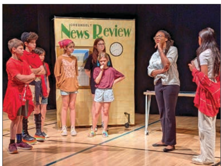
The child detectives of The Cookie Caper visit the Greenbelt News Review and consult the archives for clues.