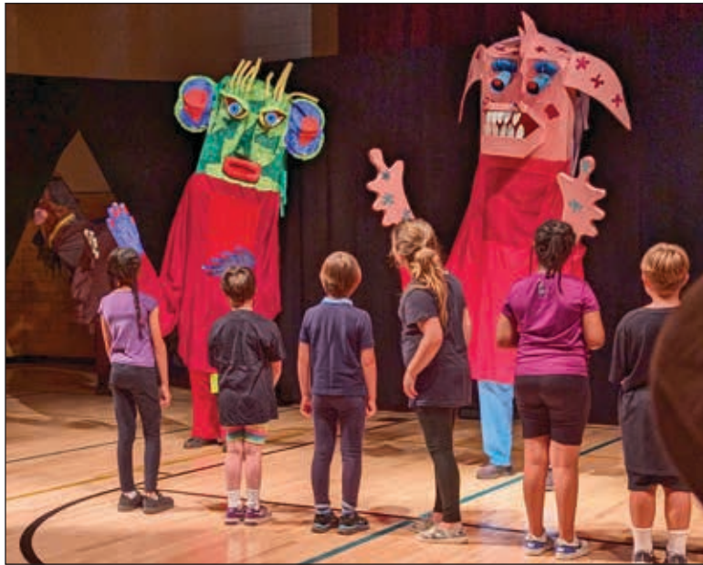
Children face monsters from the darkroom.

There are six more opportunities to see The Cookie Caper this summer, at the conclusion of the second, third and fourth sessions of the 2024 Creative Kids Camp. Both morning and afternoon performances will take place on Fridays July 12, July 26 and August 9. Free tickets can be reserved in person at the Community Center business office or over the phone by calling 301-397-2208.