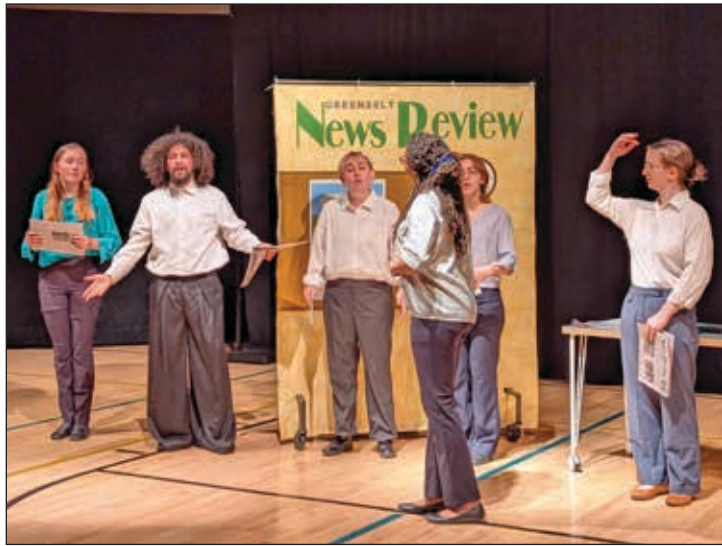
They Do Review the News Review in The Cookie Caper.