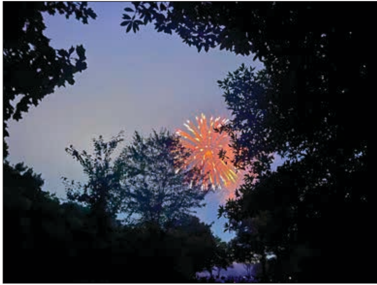
Fourth of July fireworks over Greenbelt Lake

The National Suicide Prevention Lifeline dialing code is 988. Calls and text messages are confidential and free.