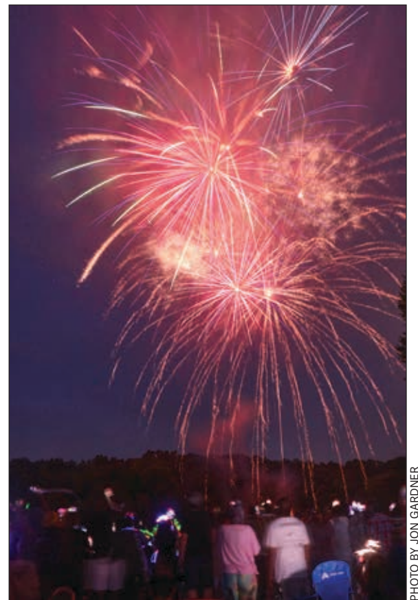
The large crowd enjoys the firework display.