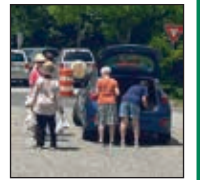
Food distribution, p.9