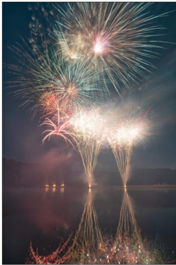
Bombs bursting in air are reflected in the Lake.