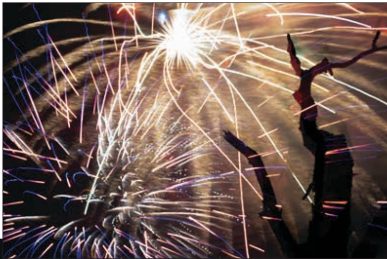
The waters of the Lake reflect the fireworks bursting above.