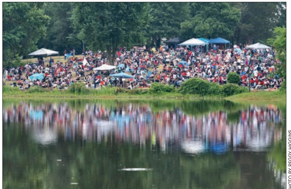
The crowd gathers at Greenbelt Lake in preparation for the Fourth of July fireworks.