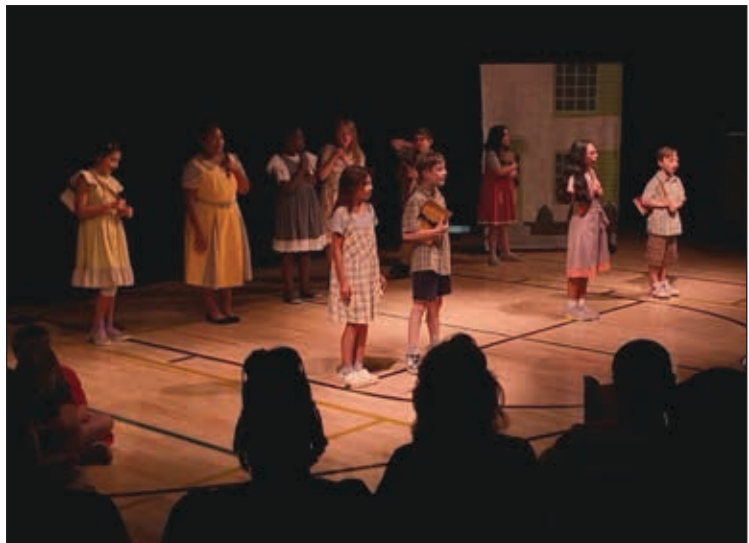
Creative Kids Session 1 campers perform a scene from The Cookie Caper on Friday, June 28.