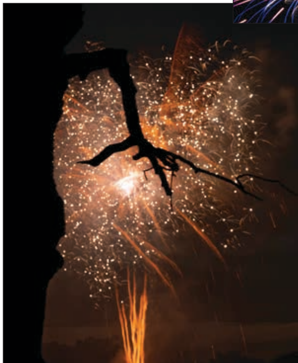
Is this Greenbelt's stand-in for Boston's Liberty Tree?