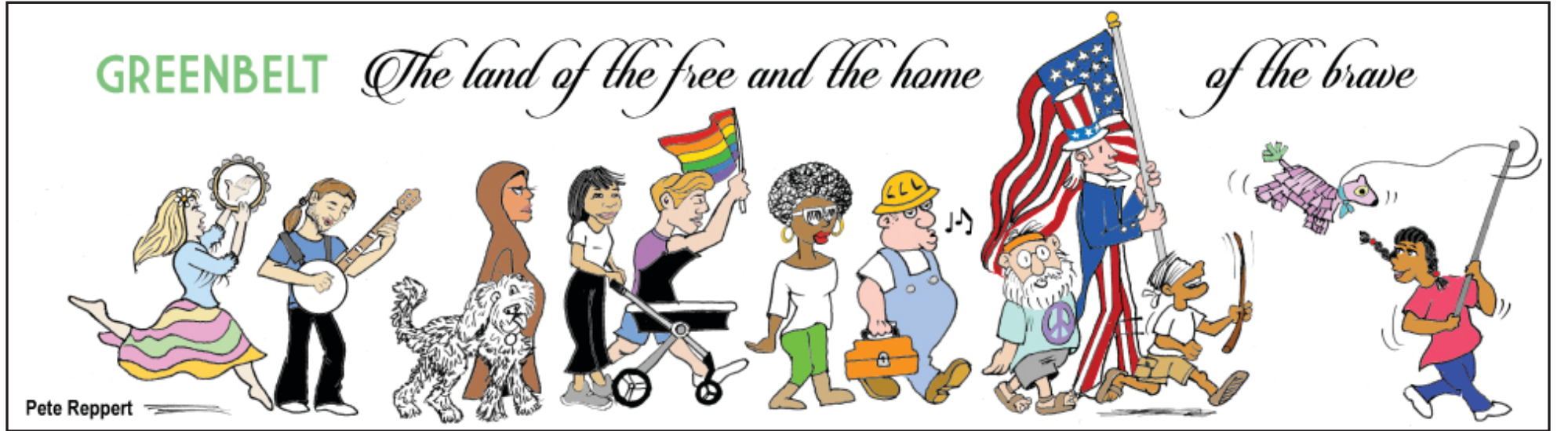
- News Review, June 27, 2019