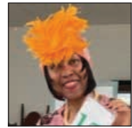
St. Hugh's Sodality tea, p.4