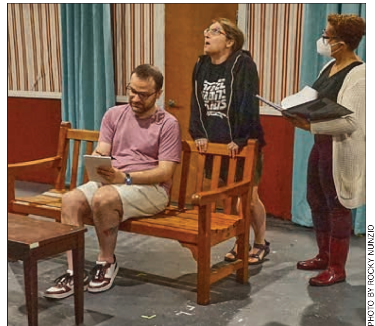
Actors rehearse for Fiveplay at GAC.