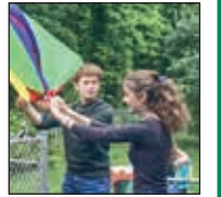
Mishkan Torah Open House, p.7