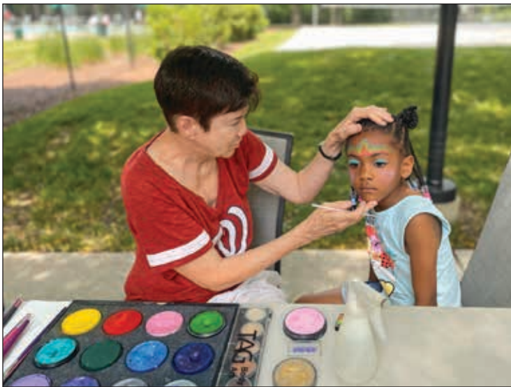
Facepainting during Greenbriar's 50th birthday celebration