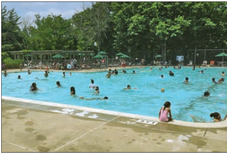
Opening day for summer 2024 at the Greenbriar pool

Greenbriar opened in 1974 in a much smaller, less crowded, less dense and much different Greenbelt. The city has grown up and around Greenbriar and its partner community, the adjacent Glen Oaks Apartments on Mandan Road, but both communities continue to thrive and survive amid the changes. They are well-maintained, safe, quiet and filled with green spaces, scores of trees, picnic areas and even a tree-filled, back-to-nature section of the Greenbelt Forest Preserve.