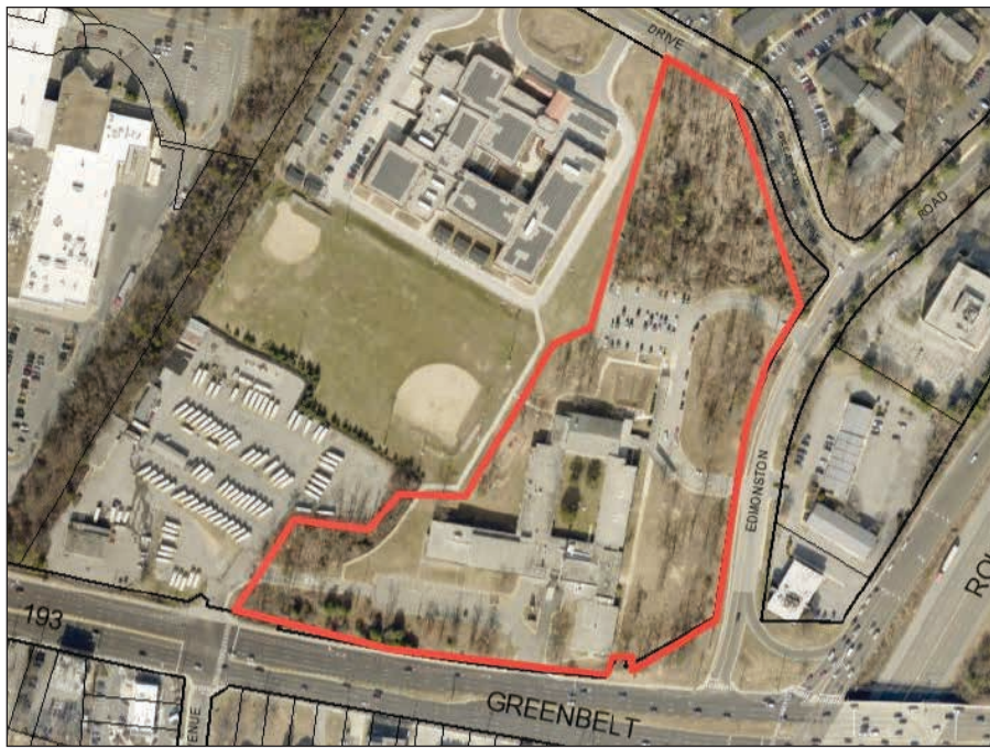
The red border marks the 12.58 acres designated as a Prince George's County Historic Site. At its left from bottom to top are the PGCPS bus lot, playing fields and Greenbelt Middle School. Greenbelt Road is at the bottom.

In January 2024 PGCPS leaders told Greenbelt City Council they planned to move DKFI out of the building in 2026 and move Springhill Lake Elementary School (SHLES) into the building while a new SHLES building is