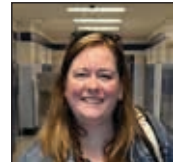
Favorite teacher nominee, p.12