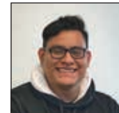
Immigrant job fair, p.6