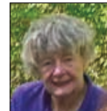
Rain Garden Clean-up, p.16