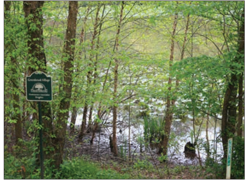
Plans are for the stormwater retention pond next to Greenbrook to be cleared out and retrofit with a forebay that will help keep the water in the pond clean as well as the water downstream.

The team also plans to install an underwater safety bench that