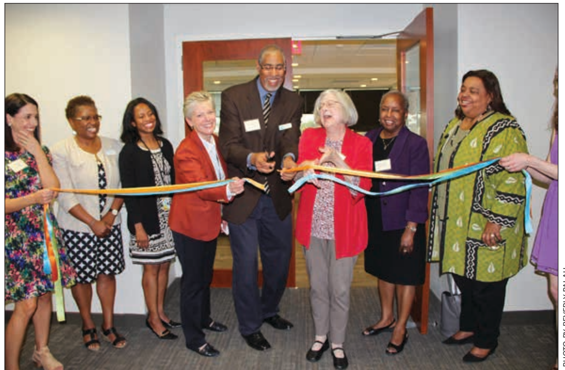
Staff of the Maryland Community Clinic Health & Wellness Services aided by Mayor Emmett Jordan officially opens their new, expanded location in Greenway Center. More space, Saturday hours and proximity to medical practitioners in the center are just a few advantages of the new office.

Este artículo está disponible en español en nuestra página web www.greenbeltnewsreview.com .