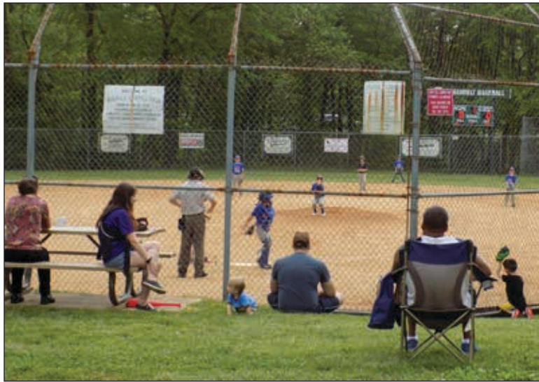
Sports fans, some just dreaming of the day they can play, too, watch as the Cubs play the Laurel Red Sox in Tuesday's game at McDonald Field.