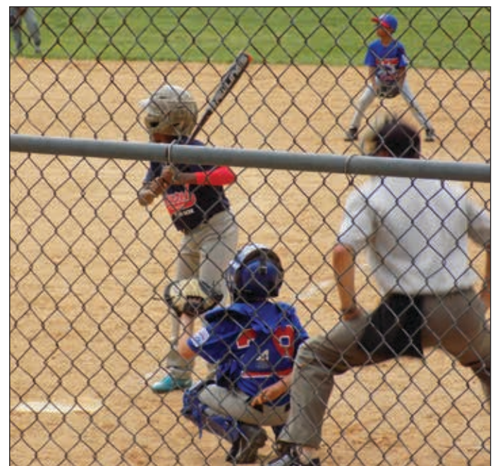
Hey batta batta batta.... The Greenbelt Cubs catcher and a left-handed Laurel Red Sox hitter await the pitch Tuesday evening at McDonald Field. See story, page 15.

The Greenway Center clinic is open Monday through Saturday from 8 a.m. to 4:30 p.m. and until 6:30 p.m. most Thursdays; call 240-624-2278 to make an appointment or for additional details. The Greenway Center WIC office is open on the second and fourth Saturdays from 7 a.m. to 3:30 p.m. Another Greenbelt location, at 9220 Springhill Lane, 240-790-3325, offers family planning, prenatal care and dental services. This office is not open on Saturdays. An expanded list of area locations and services is found at cciweb.org/locations/ .