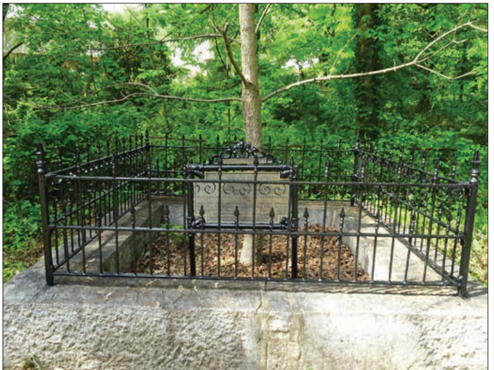
Greenbelt's 2018 Outstanding Citizen, Greg Fisanich, repainted and cleaned up the area around a plaque dedicated to Eleanor Roosevelt by the Woman's Club of Greenbelt in 1973. The plaque was originally placed under an old white oak tree on Crescent Road where Eleanor Roosevelt stood in 1937 to survey the site for Greenbelt. The tree is now gone, and a new tree is growing in its place.