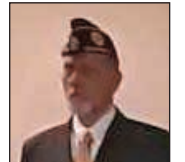
American Legion Awards, p.6