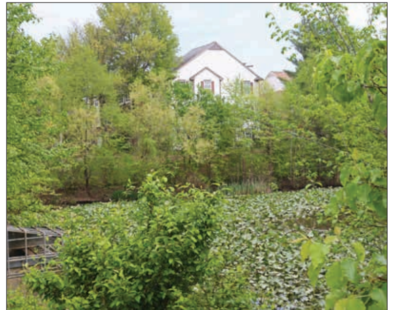
The Clean Water Partnership works with Prince George's County, local governments, land owners and engineering firms to meet Clean Water regulations and create healthier landscapes.

would safeguard against someone falling in and not being able to get out. The bench will be about a foot under water and covered by plants so it won't be visible from the edge of the pond.