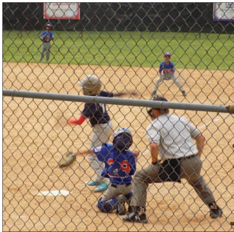
Batta batta SWING! The bat disappears as a Cubs pitcher smokes a Laurel Red Sox hitter; the Cubs' first baseman reacts.