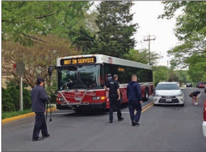
A UMD Shuttle Bus and vehicle accident briefly ties up traffic on Ridge Road on Tuesday, April 30. No injuries were reported.

The driver said that she had been looking in her rear-view mirror to check the traffic behind her and was surprised by the stopping of the bus in front of her. Though apparently uninjured, she was upset that she would be late for class that morning and worried that her driving privileges would be rescinded.