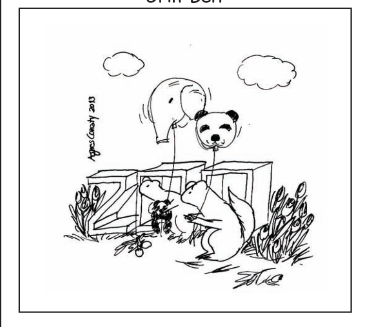
"Best spring break trip ever!"