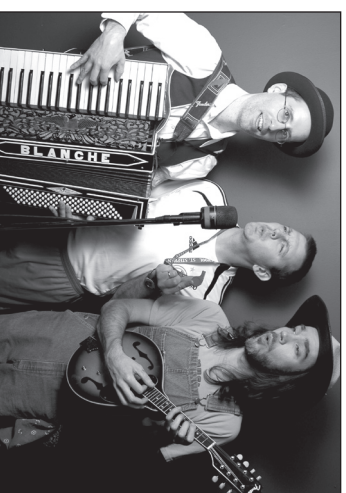
"Rocknoceros" plays rock-n-roll for children of all ages Saturday afternoon at 3pm.