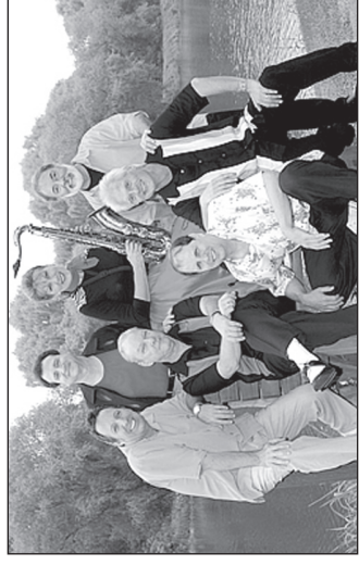
"The Fabulous Hubcaps" will perform on Monday from 2 to 4:30pm.

6pm FESTIVAL ENDS . . . See you next year!