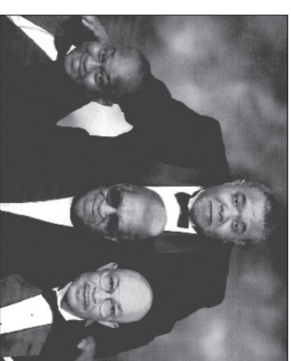
"The Legendary Orioles" will be on hand Sunday night from 9pm to Midnight.