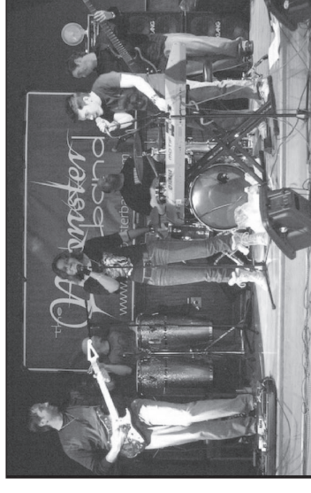
Dance to the funk/rock/R&B sounds of "The Monster Band" on Friday night from 9pm to Midnight.

CARNIVAL MIDWAY OPENS Midway. Rides by Rosedale Amusements. Games, food, sale & information booths organized by Greenbelt organizations. Booths constructed and wired by Greenbelt Public Works Department. No charge for entertainment, shows or events unless noted.