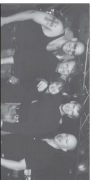
"Diamond Alley" will bring a wide variety of favorites to the stage on Saturday night from 9 to 12 Midnight.