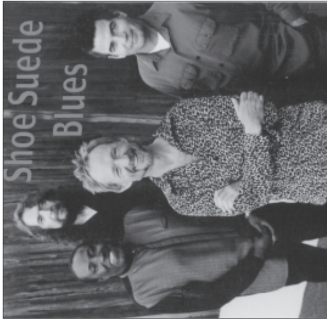
“Shoe Suede Blues” featuring Peter Tork of “The Monkees” fame (center) will be on hand Monday from 12 Noon to 3pm.

Prices subject to change without notice; no refunds.