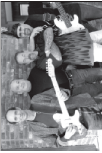
"Nighthawks" will be on hand Friday night from 9pm to 12Midnight.